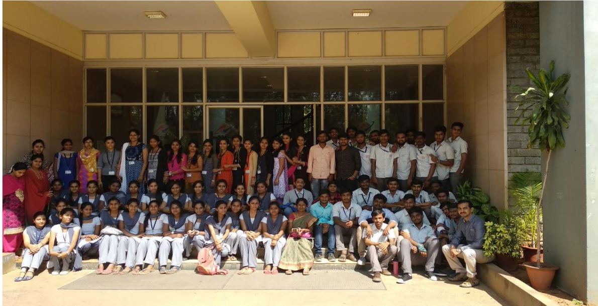
Industrial visit to BSNL Training Institute, Mysore on 16/02/2018. Students got exposure on various laboratories like mobile communication, optical fiber cable, broadband.