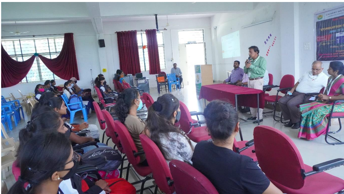
ONE-DAY WORKSHOP CONDUCTED ON 27/08/2021 BY THE DEPARTMENT OF E&CE ON "SIMULATION OF ANALOG CIRCUITS AND ITS APPLICATION FOR SECOND YEAR STUDENTS"