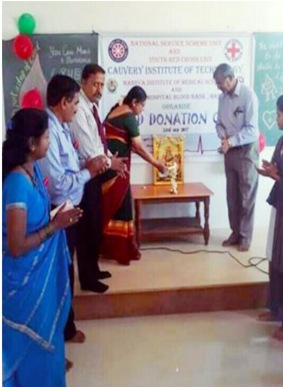
Blood Donation Camp in association with Red Cross and NSS