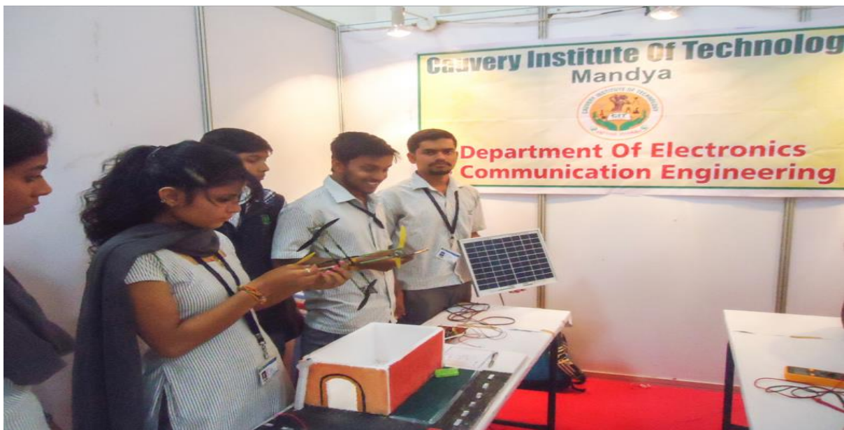
Students Participated in Project Exhibition at Jnana Vijnana Tantrajana Mela (JVTM-2017)