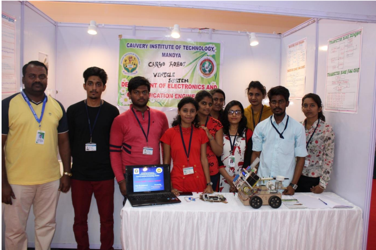
Students Participated in Project Exhibition at Jnana Vijnana Tantrajana Mela (JVTM-2019) On 19 th & 20 th February 2019, Sri Kshetra Adichunchanagiri, Nagamangala Taluk, Mandya District.