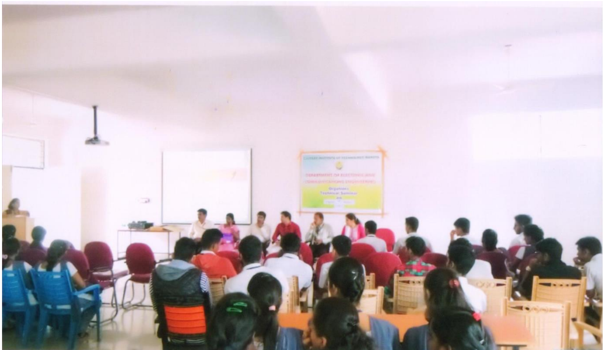
Inauguration of 3days Workshop on Robotics Adventurous held on 25/09/2018